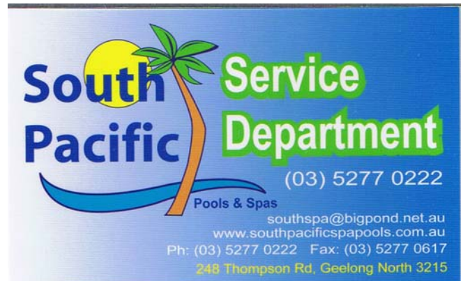
South Pacific Pools and Spas North Geelong