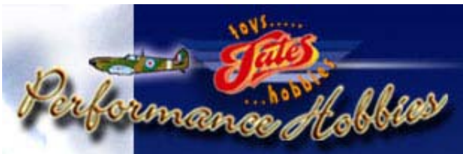
Tates Performance Hobbies West Geelong