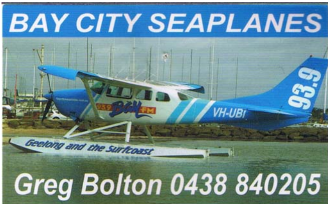
Bay City Seaplanes Geelong