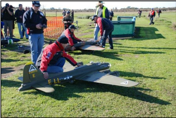
It really is that big.