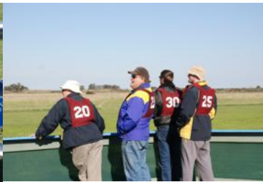
Some of our "Crew"