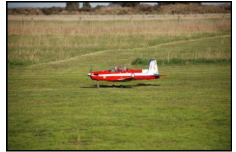
Phew, made it!!!!