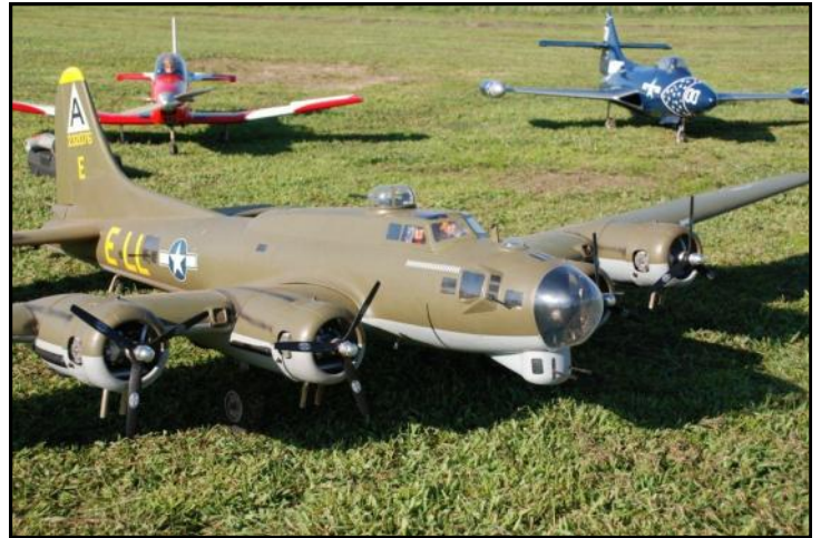
B17 up close.