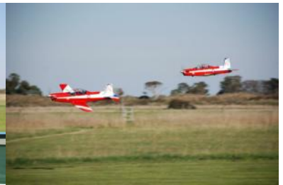
80 inch PC9's powered by O.S 2000 4 stroke's.