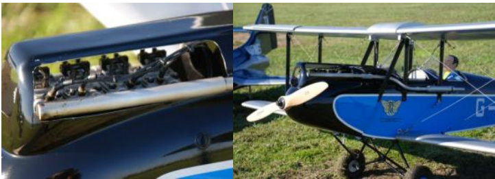
O.S Inline 4 cylinder 4stroke