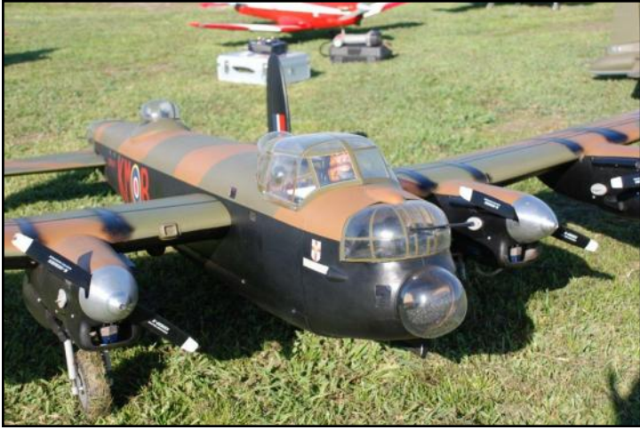
The Lancaster up close.