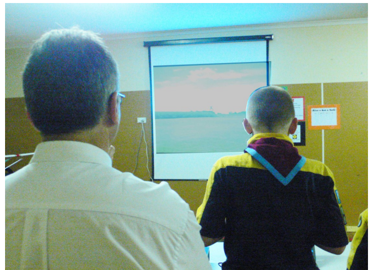
The simulator on the projector is very impressive.