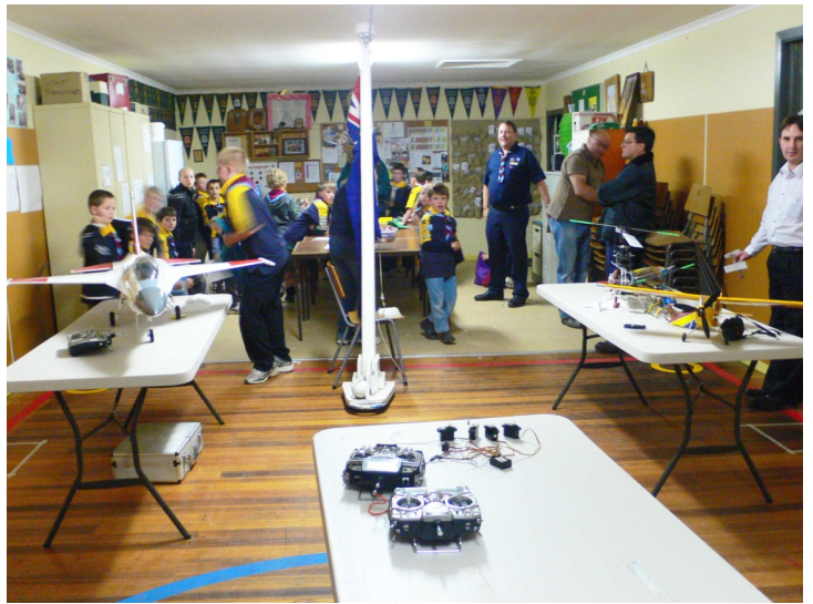
In the foreground is Felix's demonstration rig with a transmitter and 4 servos. On the left is Shane's turbine model, and the 2 helicopters on the right.