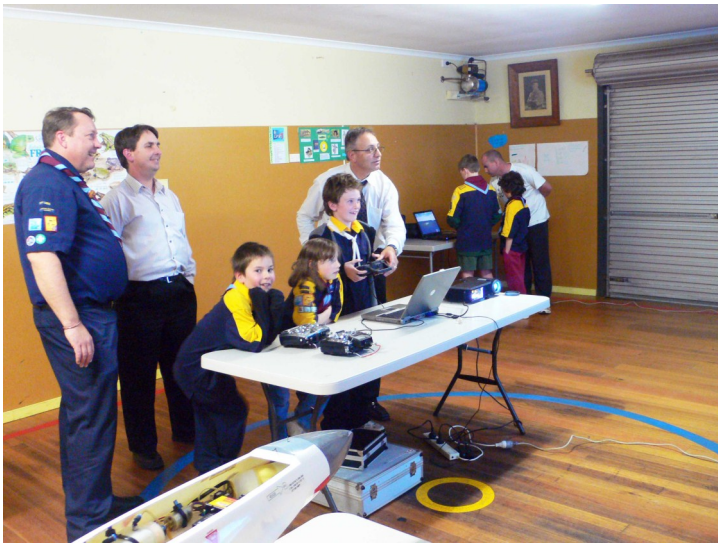
The cubs found the simulators very entertaining.

them all occupied. I was a cub and scout about 50 years ago, and I was surprised how similar the whole organisation still is. They even had a picture of Lord Baden-Powell, the founder, on the wall. The leaders and the kids appreciated our input, and they want to organise a Saturday to come to the Dog Rocks and observe the flying.